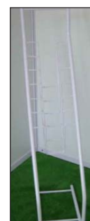
Literature Stand W H D 300 1200 400