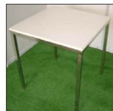
Square Meeting Table W H D 750 750 750