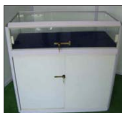
Glass Counter W H D 1050 1050 550