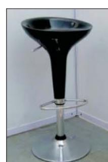
Bar Stool Dia 430 mm