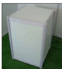
Display Podium W H D 500 750 500