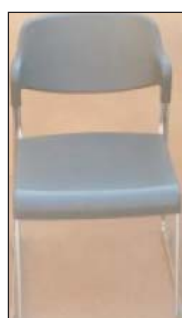
Chair W H D 435 760 600