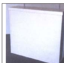
Bar Counter W H D 1010 1000 620