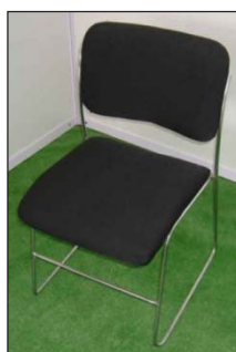
Nova Chair W H D 500 810 600