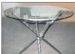
Lounge Table (Round) Dia H 750 750