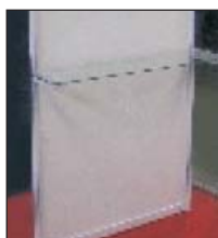
Shelf (Glass) W D 1050 300