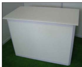
Counter W H D 1080 750 540