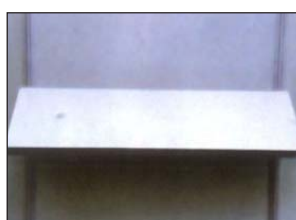
Shelf (Wooden) W D 1050 300