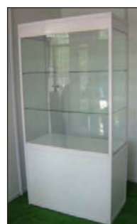
Glass Show Case W H D 1000 2000 500