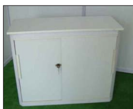
Lockable Counter W H D 945 750 400