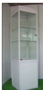
Glass Show Case (Slim) W H D 500 2000 500